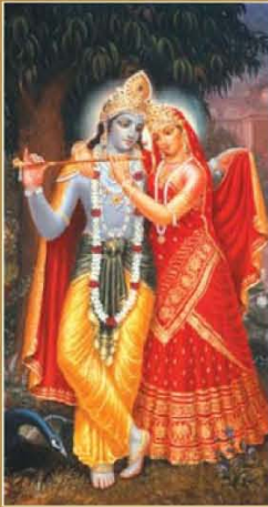
Sri Radha-Krishna are together, the one supreme Absolute Truth.