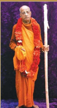
His Divine Grace A. C. Bhaktivedanta Swami Prabhupada, Founder-Acarya of the International Society for Krishna Consciousness.