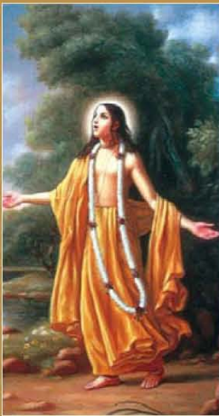
Sri Caitanya Mahaprabhu, the combined incarnation of Radha-Krishna, inaugurated the chanting of Hare Krishna five hundred years ago.